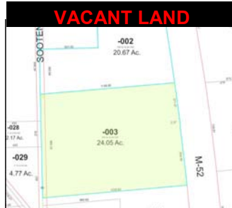
0 Sooten Rd Manchester