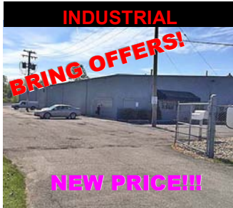
175 Rawsonville Belleville