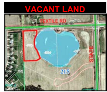
0 Textile Pittsfield Twp