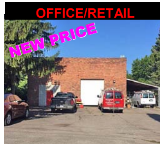
578 Sumpter Belleville